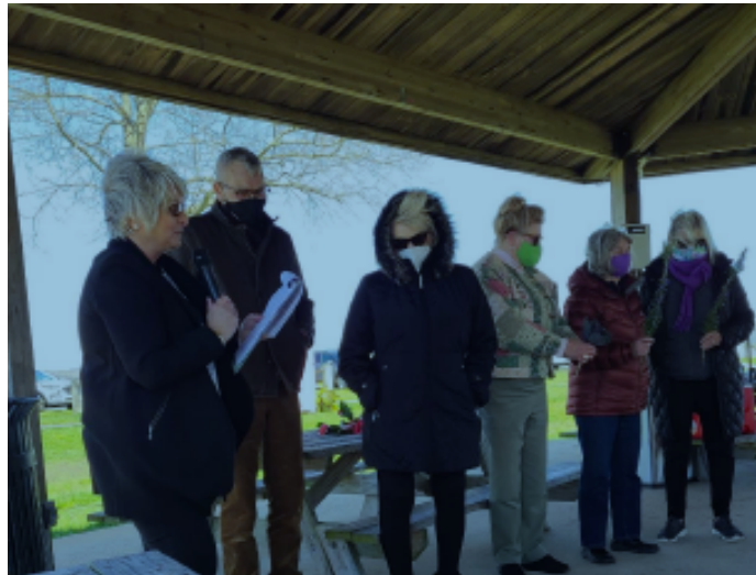
DGC members braving the weather in our first outdoor meeting in 2021: the installation of officers for 2021-2023

A bit chilly still, but very happy to start meeting again.