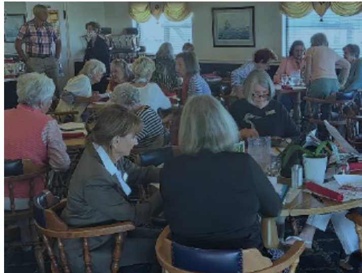
Always a great lunch served at CYC