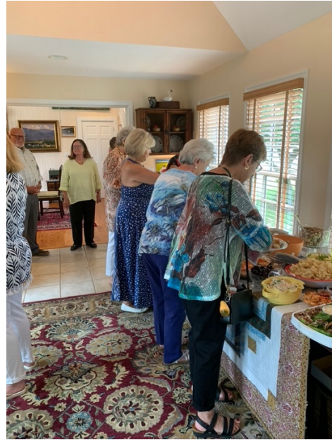
A delicious potluck lunch was served at the Annual Picnic in June 2021

Due to the pandemic, last year's event was cancelled and since regular meetings for 2020 were suspended, this year's program recognized the design and horticulture top awards recipients for 2019-2020.