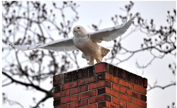
The snow owl visited Cambridge