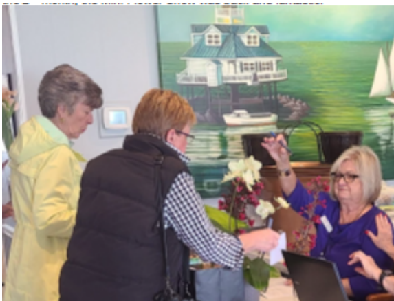
Members lining up with their entries