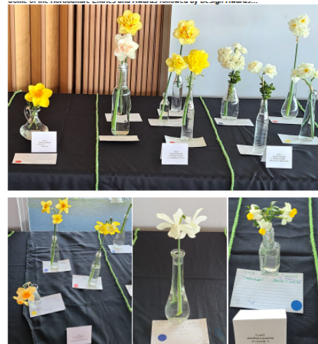
A lovely array of daffodils grown by club members