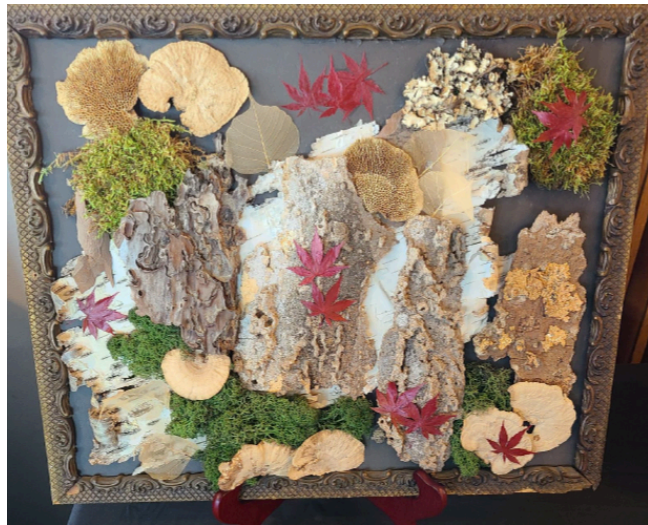
A “Plaque Design” submitted in the mini flower show