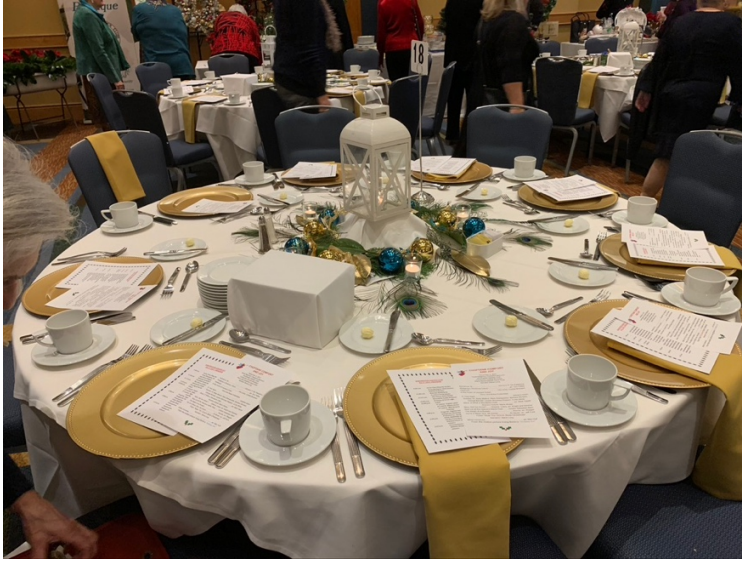
The tables were beautifully set by the Hyatt DGC Gala Committee created the centerpieces

“Holiday on the Choptank” Gala, Thursday, December 2, 2021