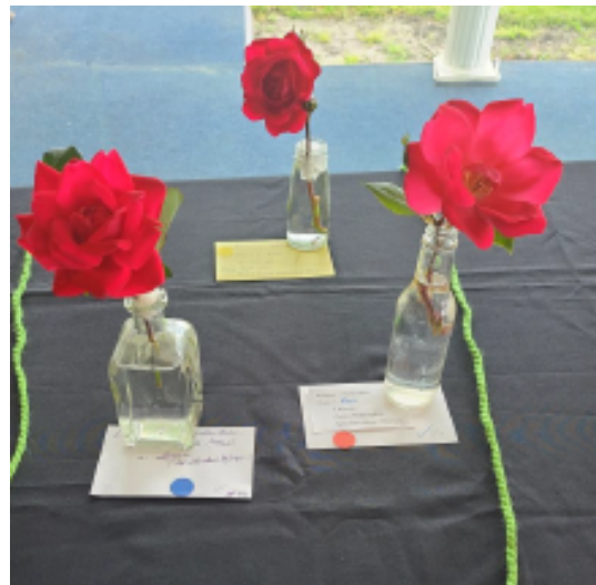
A beautiful selection of roses