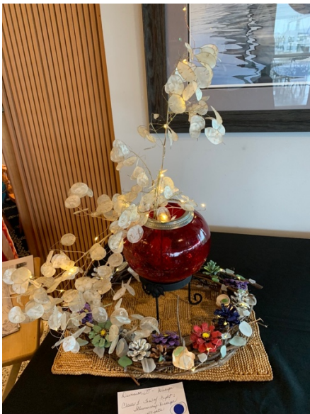
An entry in the Design Division of the Mini Flower Show