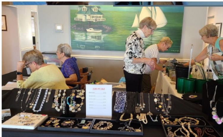
The “Diggers” offered a gently used jewelry sale