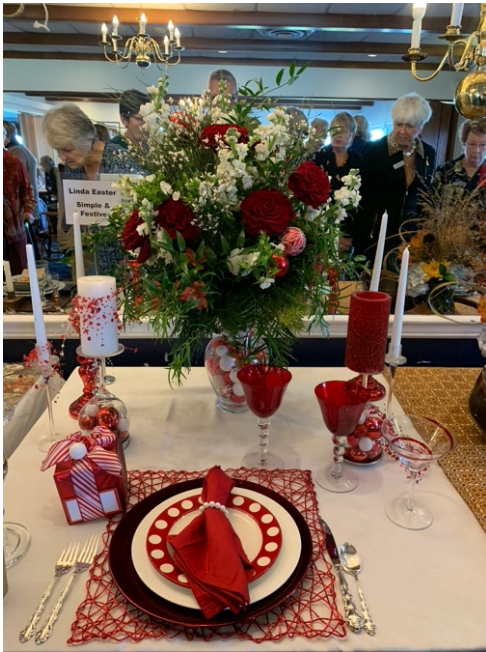
BIG is better with Linda Easter's Tablescapes