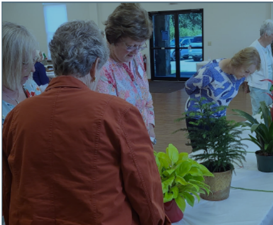
Members admiring flower show entries