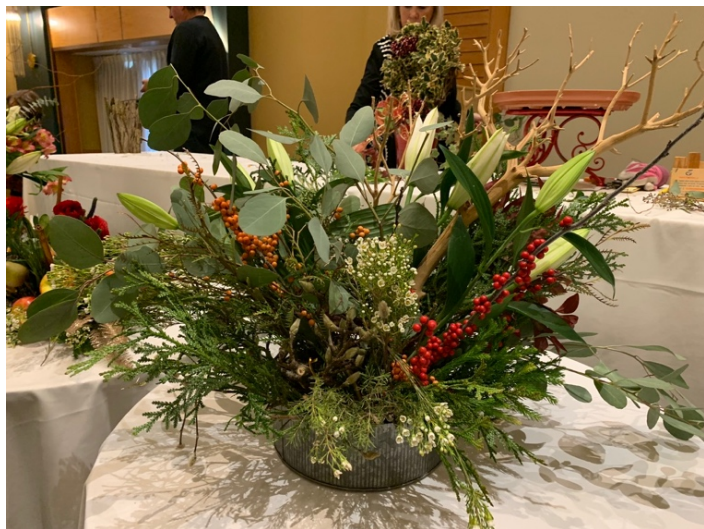
One of the designs offered up for raffle