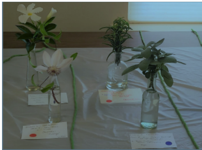
A group of flower show entries