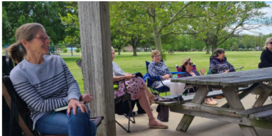
Several members participating in the meeting