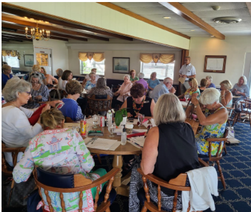
We had a great turnout at CYC