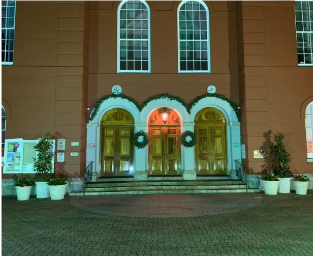
Dorchester County Courthouse dressed for holidays