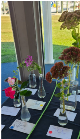
Entries for the Mini Flower Show