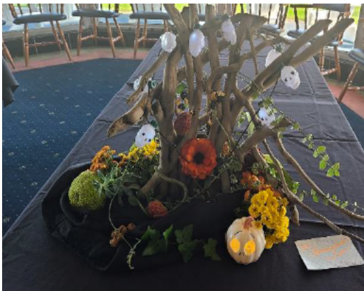
A design entered in the Mini Flower Show