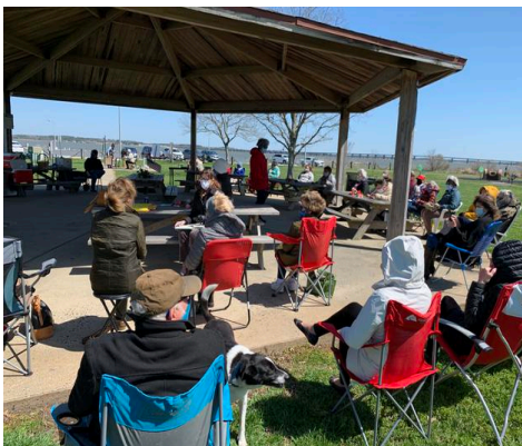
Socially distanced in the bitter cold at Great Marsh Park