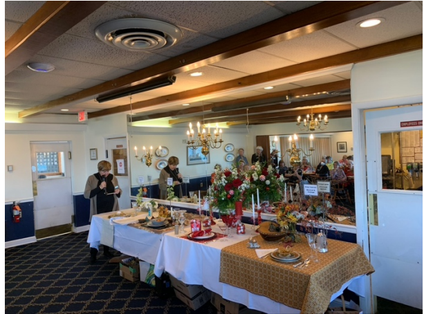
Four beautiful Tablescapes were presented