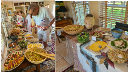
A delicious potluck lunch