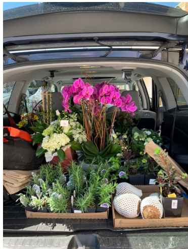
Goodies for our first outdoor meeting in 2021