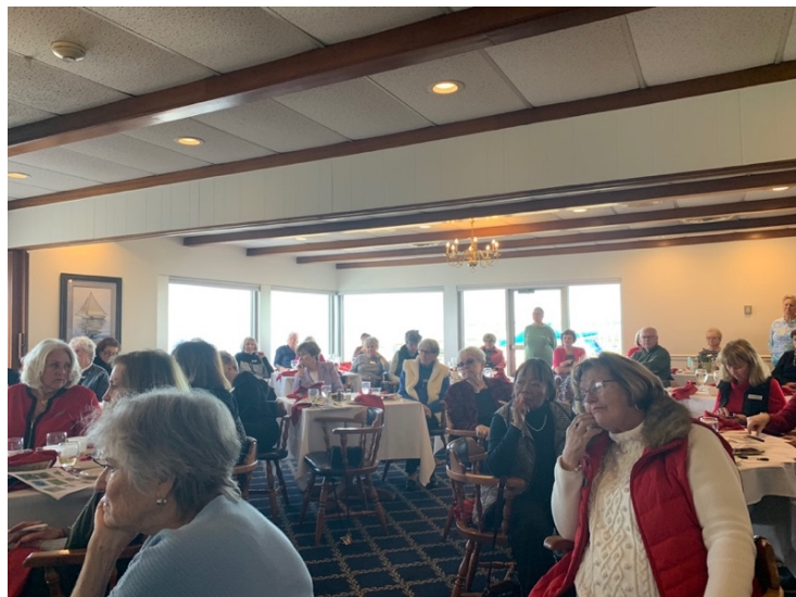
Members thoroughly enjoyed the program